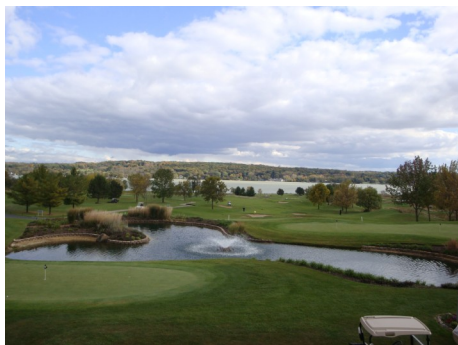
National Championship at Geneva, WI