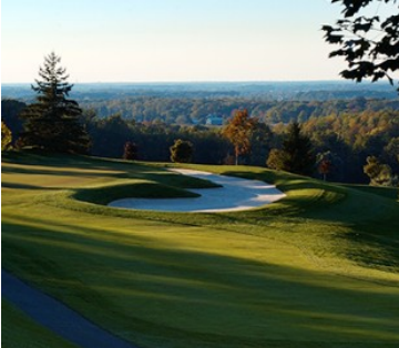
Peninsula Lakes GC, second hole

On Sunday August 22, our August Special Event was held at Peninsula Lakes Golf Course.