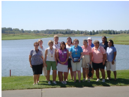
Group photo at Sectionals