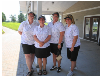
Scramble team at Chapter Championship